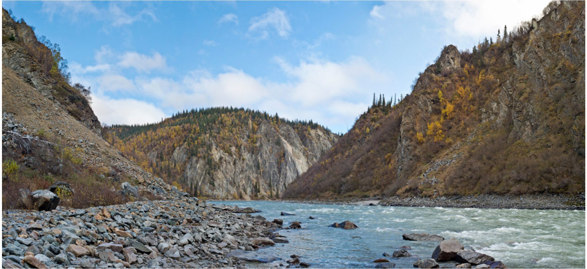
AL 13 existing FALL.jpg