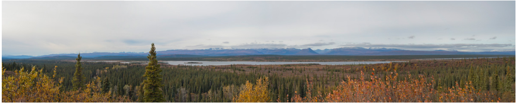
AL 5 existing FALL.jpg