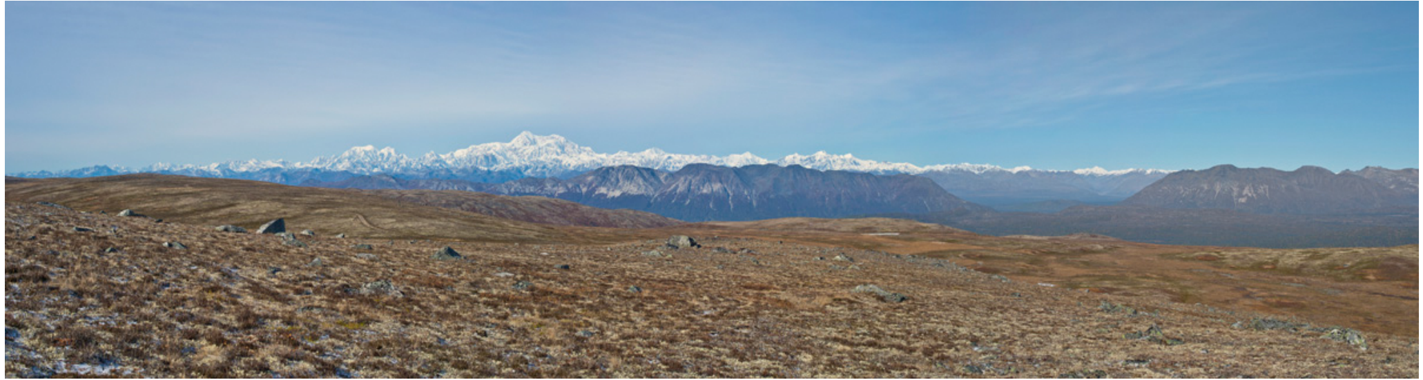
AL 1 existing New Denali view Fall.jpg