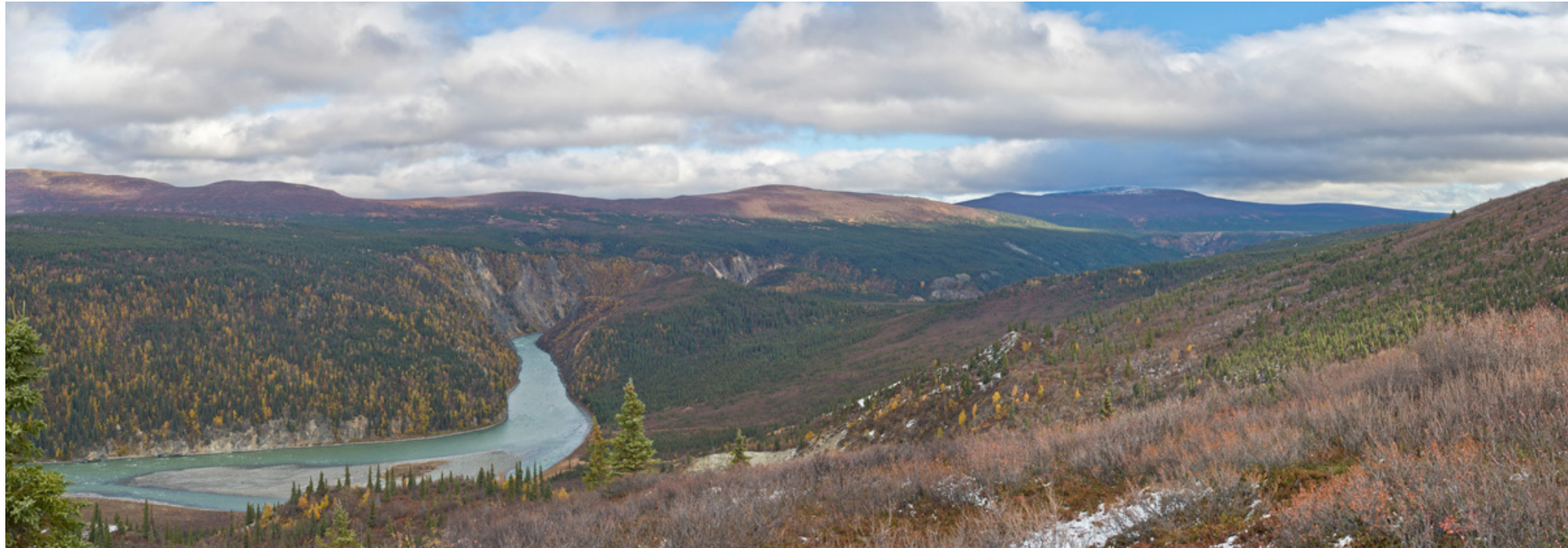
AL 14 looking east FALL.jpg