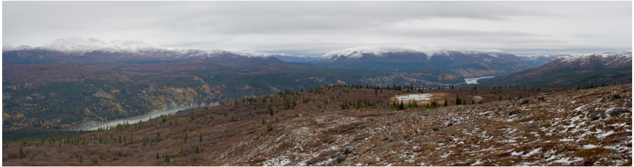
AL 9 existing upriver FALL.jpg