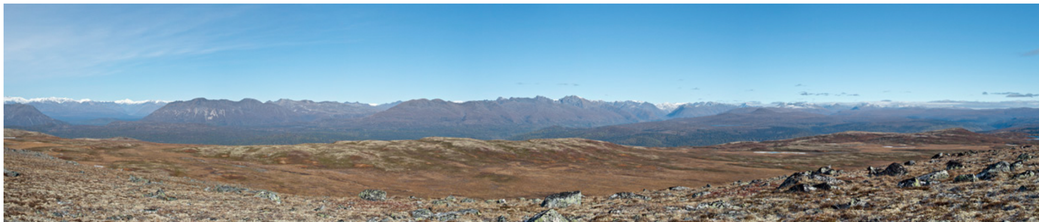
AL 1 existing view towards corridor FALL.jpg