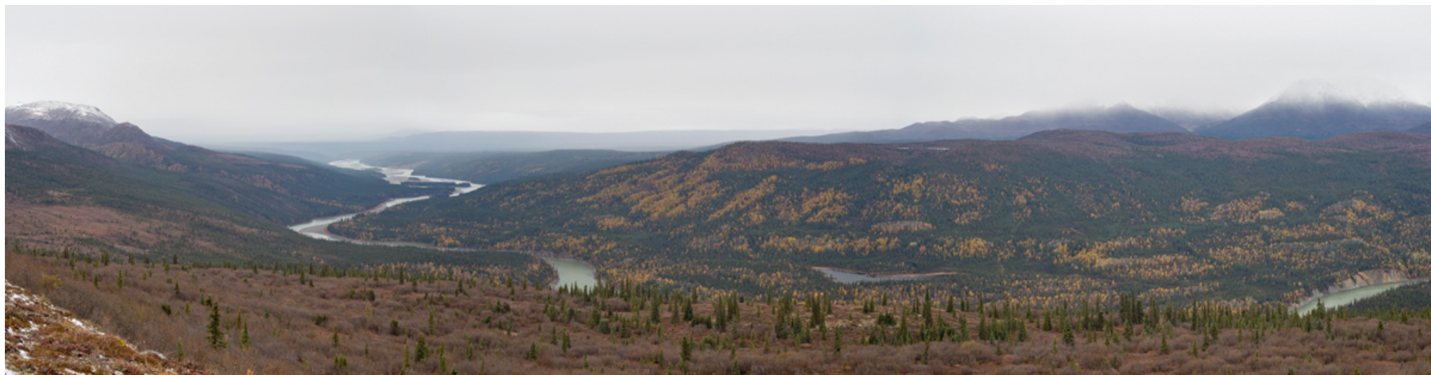
AL 9 existing downriver FALL.jpg