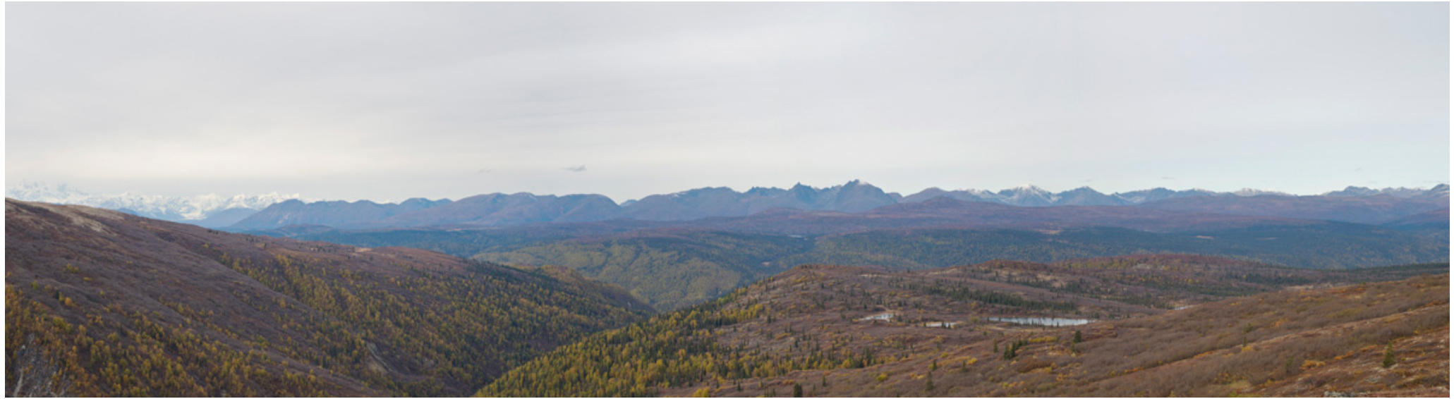
AL 4 existing FALL.jpg