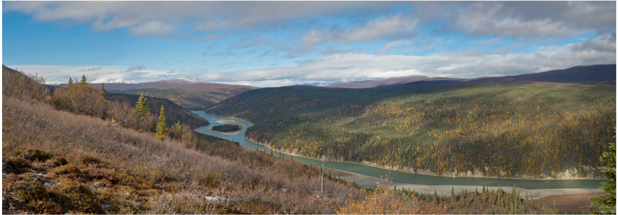
AL 14 Existing looking west.jpg