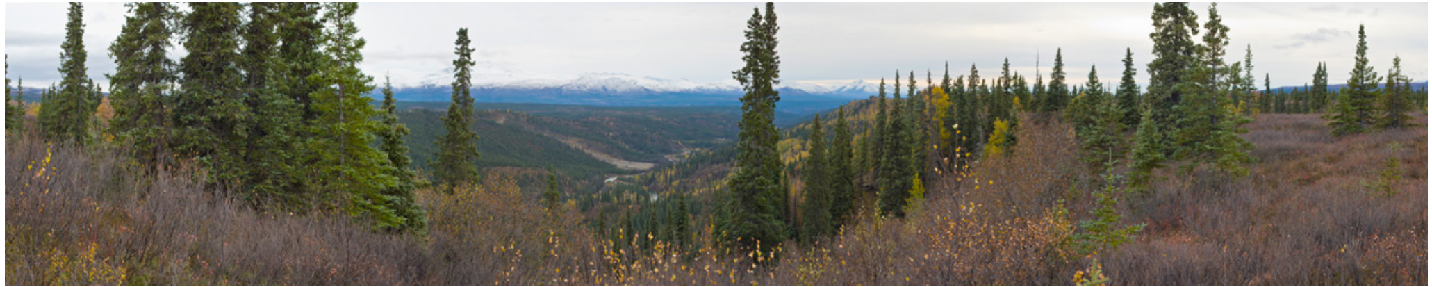
AL 7 existing FALL.jpg